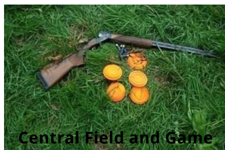
Central Field and Game