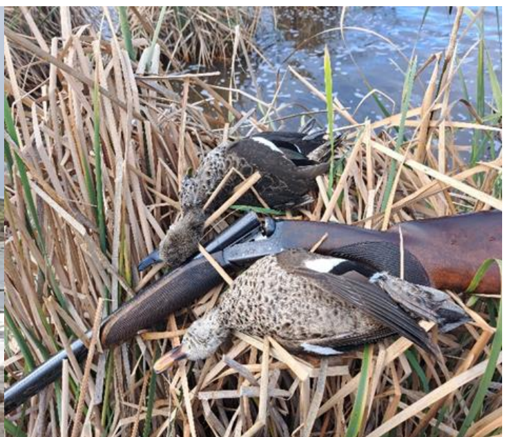
Couple of Teal during a morning hunt.