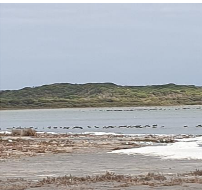
Lake George on the opening, not a bad photo using a mobile phone, Showing us waterbird life on the water.